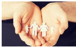
SPEAKING UP FOR TAMAR: PROTECTING & HEALING THE WOUNDED