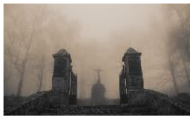
ADDICTIVE BEHAVIORS: A BANQUET IN THE GRAVE

Last spring a church asked for help understanding how to provide accountability and extend forgiveness in a situation where life-long addictive sin had been revealed with one of their members. I put together this weekend workshop. If you would like access to the audio recordings of this workshop, three of the four sermons were successfully recorded.