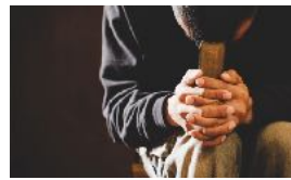
THE IMPORTANCE OF CONFESSION & REPENTANCE