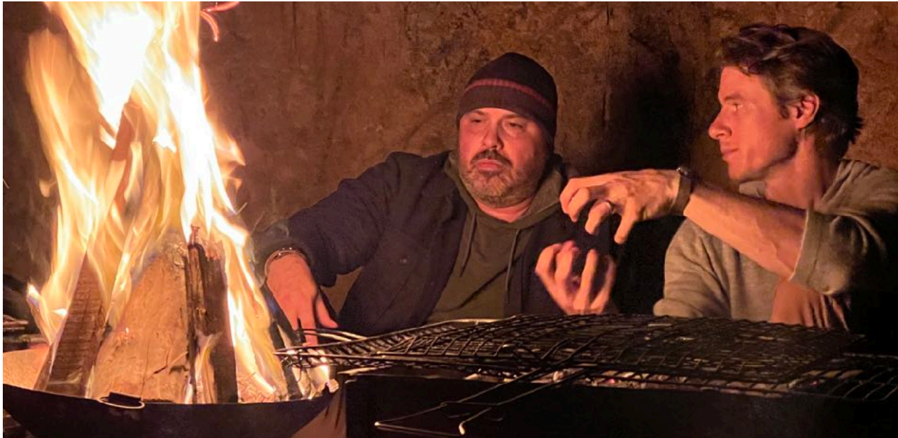
MY BROTHER-IN-LAW AND I TALKING ABOUT EXODUS BY A FIRE ON THE TOP OF MT. SINAI