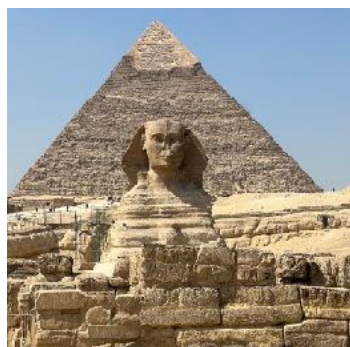
SPHINX AND PYRAMIDS