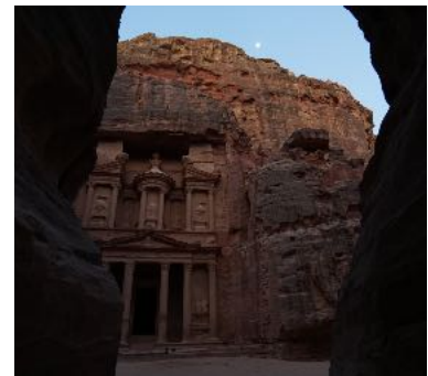
PETRA AS THE SUN CAME UP