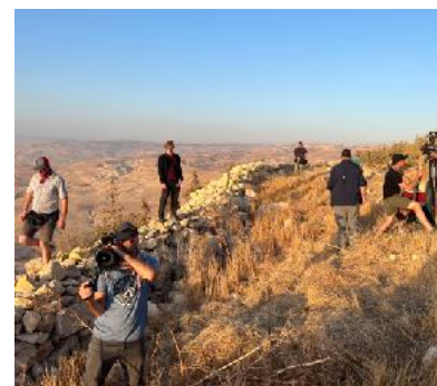
OUR TEAM AT MT. NEBO