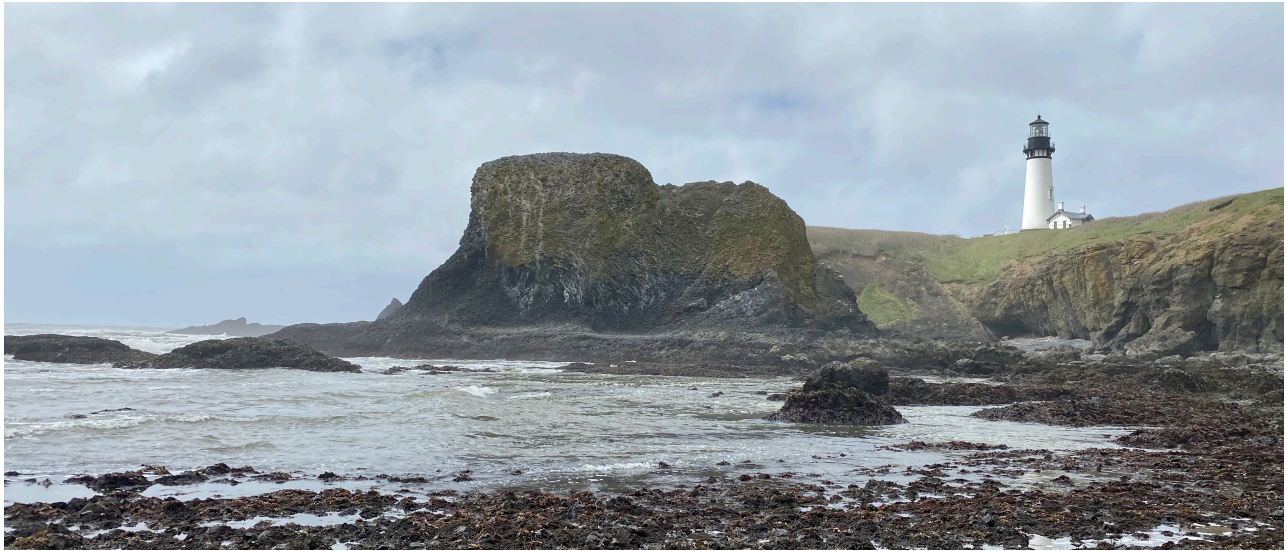
THE YAQUINA HEAD LIGHTHOUSE, THREE MILES NORTH OF NEWPORT, OR. WE TOOK MY MOM TO VISIT THE LIGHTHOUSE DURING OUR TRIP FOR MY UNCLE'S FUNERAL.